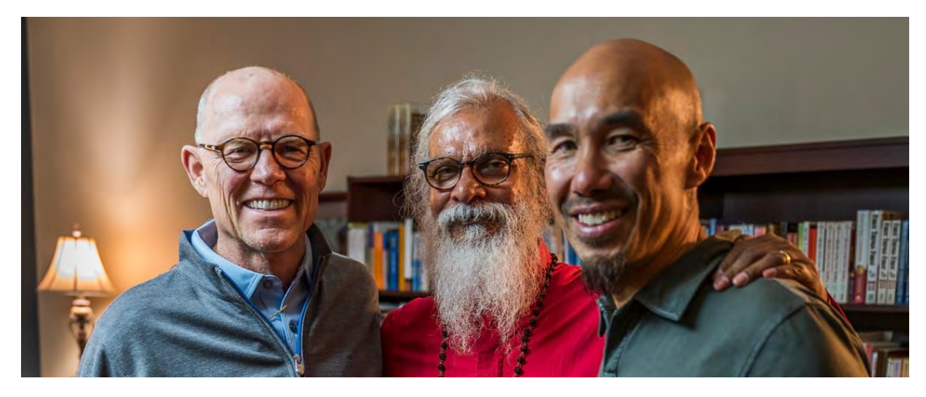
"It's a ministry that I not only endorse, but it's the model of how I want to continue in ministry for the rest of my life."

As a Christian missions order we function as a community, and by joining GFA World you'll be joining a family that's doing life together, journeying towards Jesus, living for eternity, and making a difference for some of the poorest and most afflicted people on earth, in Christ's name.